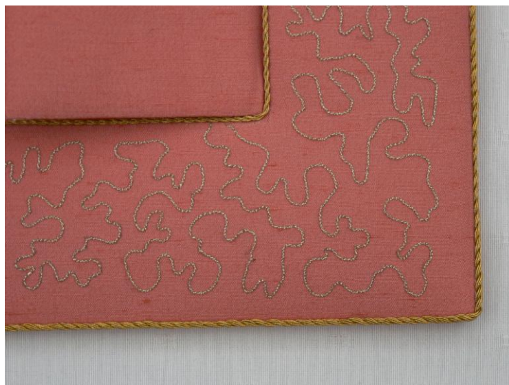
Fig.9 Corner frame of mirror box