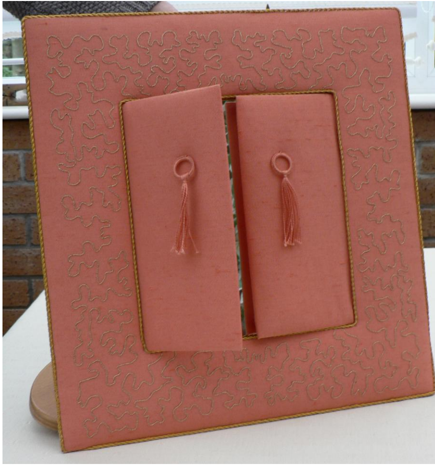
Fig.8 Mirror box in satin dupion embroidered with couched gold thread.