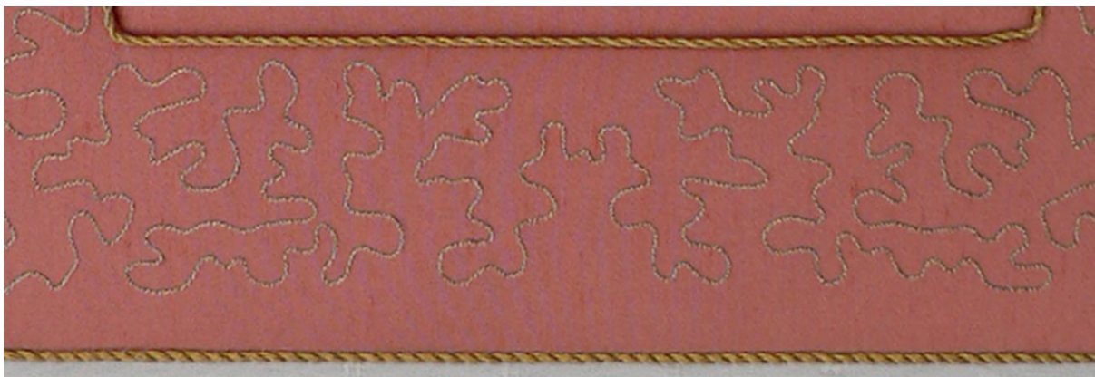
Fig.2 Surface couched threads on a mirror frame

With surface couching the thread is laid on the surface and caught down from the top to the back with a small stitch.