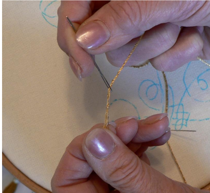
Fig.4 if the braid is prone to fraying, knot the end after passing it through to the back of the work.

Use a sharp needle with a large enough eye to take the laid thread without fraying. Pull the tail of the laid thread through to the back of the work and leave without anchoring. This will be anchored and trimmed at a later stage.