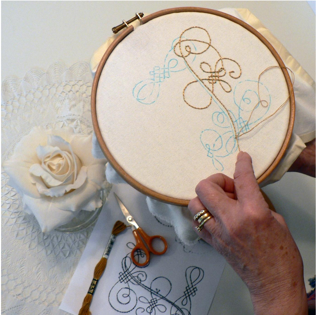
Fig.5 The fabric is mounted in a seat frame to allow easy access above and below the work

Once the design has been traced onto the fabric select an appropriate thread and lay it along the line of the design. Using a finer needle and matching or contrasting thread stitch over the laid thread with a small stitch. Keep the stitches an equal distance from each other. Bend the laid thread round the curves. Where threads overlap, stitch either side of the laid thread, but do not pull too tightly!