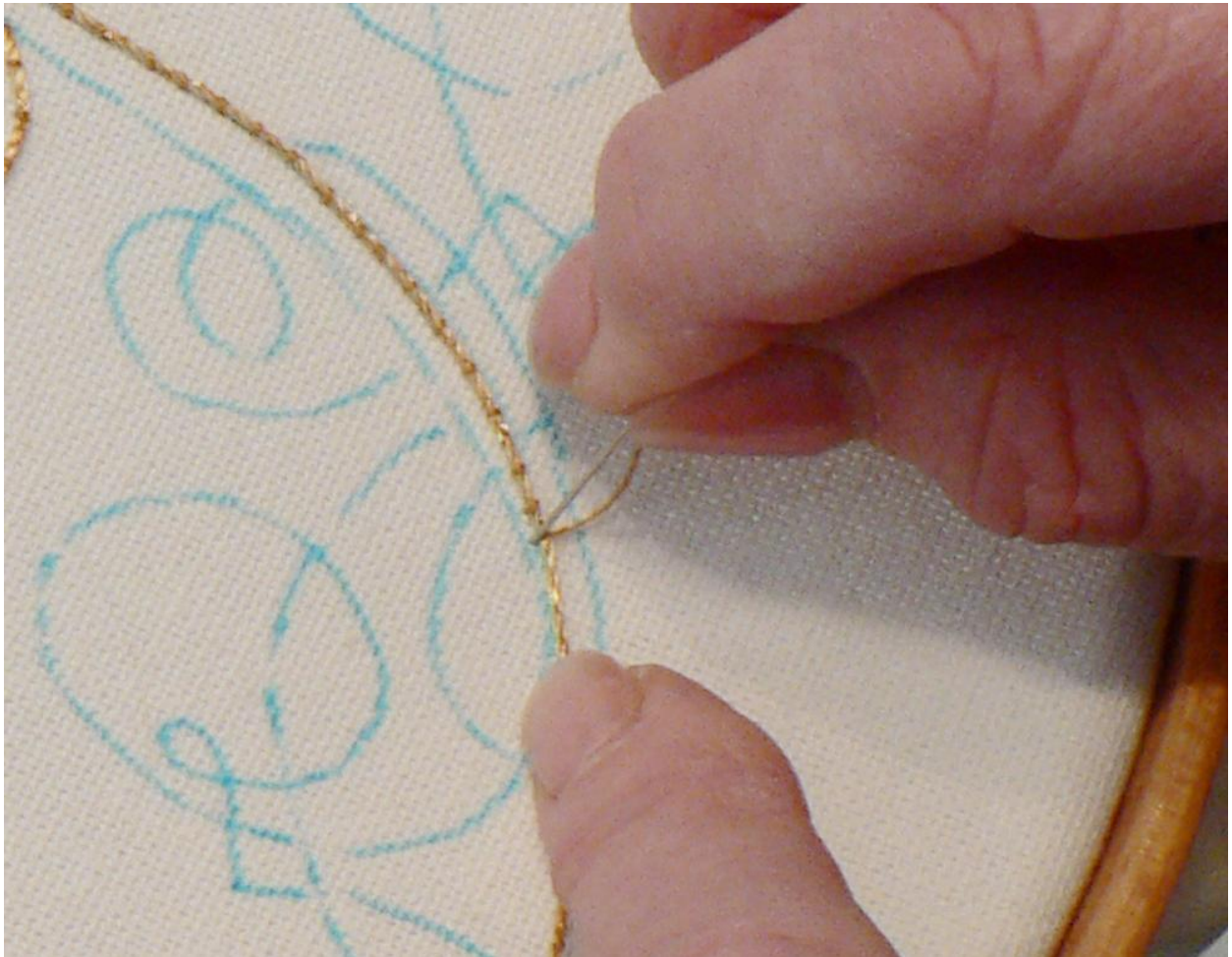
Fig.6 Even stitches approximately a quarter of an inch apart hold the surface braid firmly in place

When the laid threads have been couched down, turn the work over and catch the loose ends along the length of the small stitches so that the ends do not show on the right side of the work