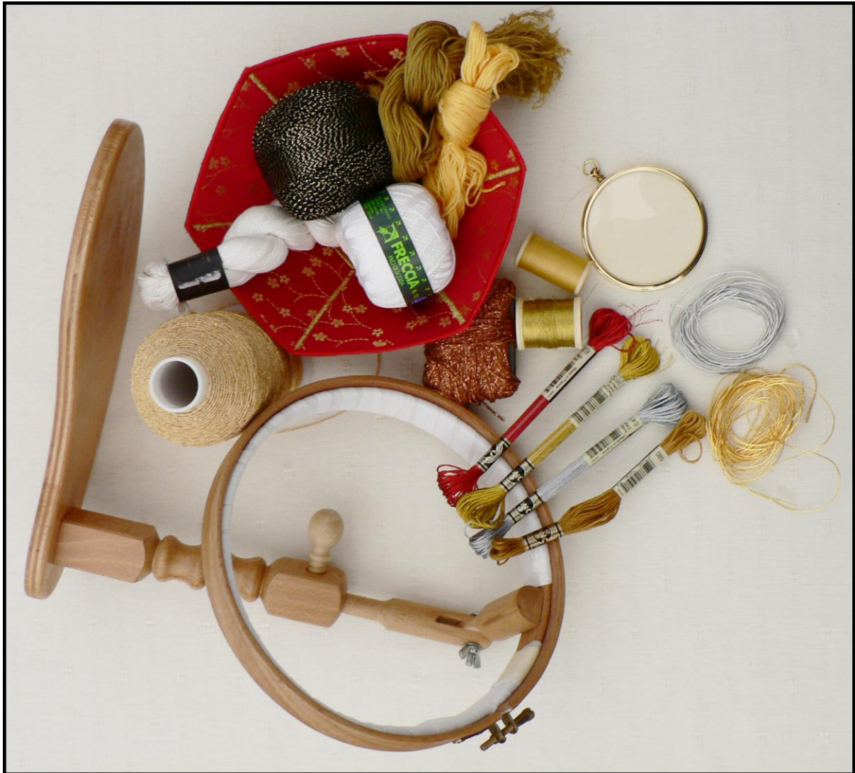
Fig.3 Seat frame and threads suitable for couching

The thread is brought up from the back to the front of the work. A small stitch is made over the laid thread and the needle passed through to the back.